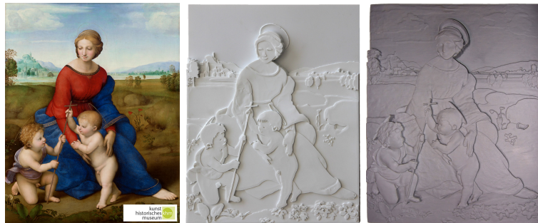
Fig. 1. Tactile paintings [11] of Raffael’s Madonna of the Meadow . From left to right: a) original 2D painting, b) 2.1D layered depth diagram, c) 2.5D textured relief.

In order to cover the technically most challenging conversion possibilities according to Table 1, and to gain hands-on experience in the different fields, we performed two projects in co-operation with local museums.